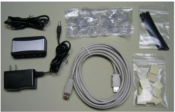
Hub-Kit (USB hub may look different)