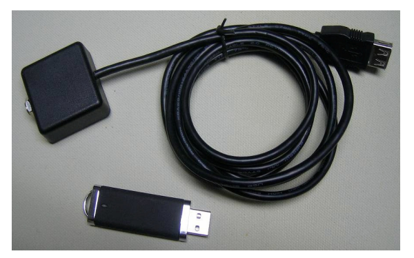
Multi-Panel Controller and USB flash drive

Up to 100 Star Bright panels can be connected together using multiple Hub-Kits and one Multi-Panel Controller to form one large display.